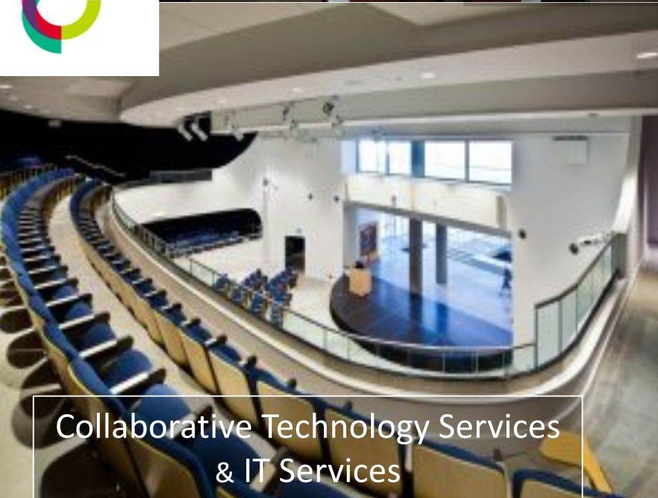
Collaborative Technology Services & IT Services