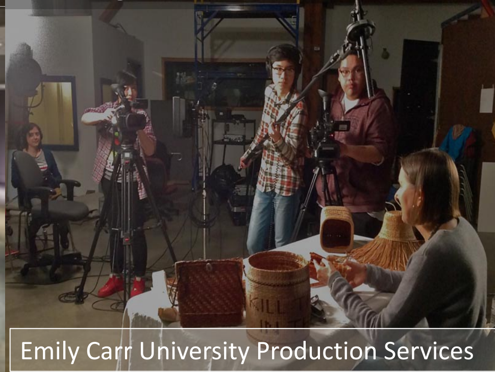
Emily Carr University Production Services