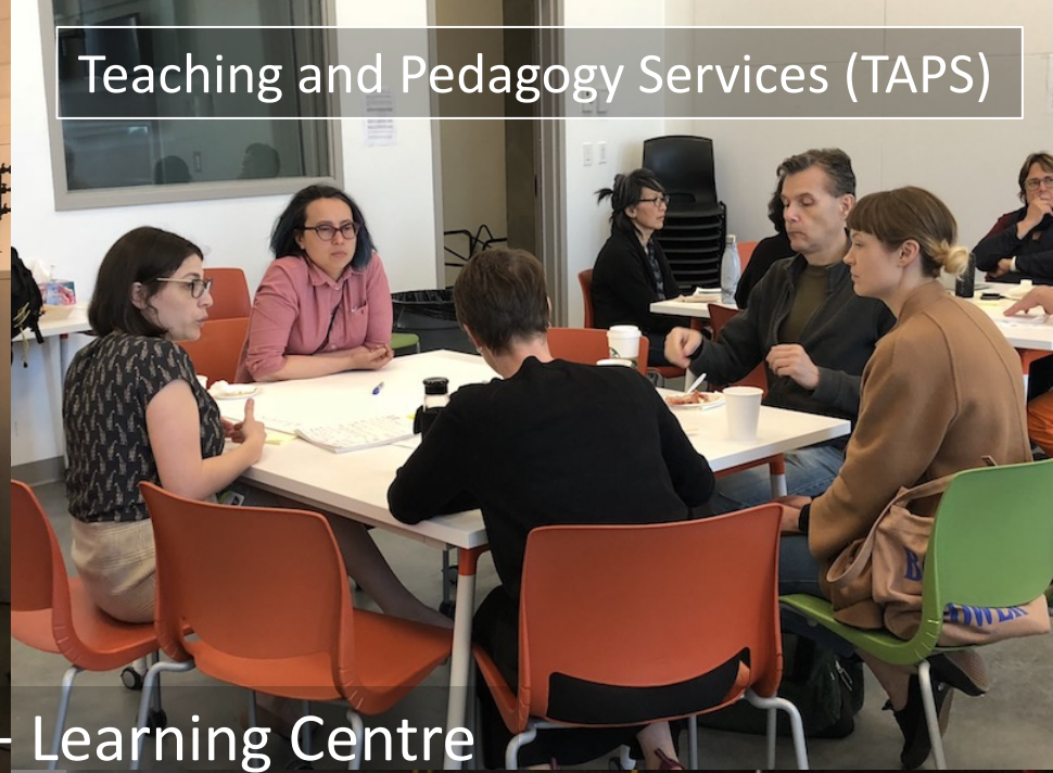
Teaching and Pedagogy Services (TAPS)