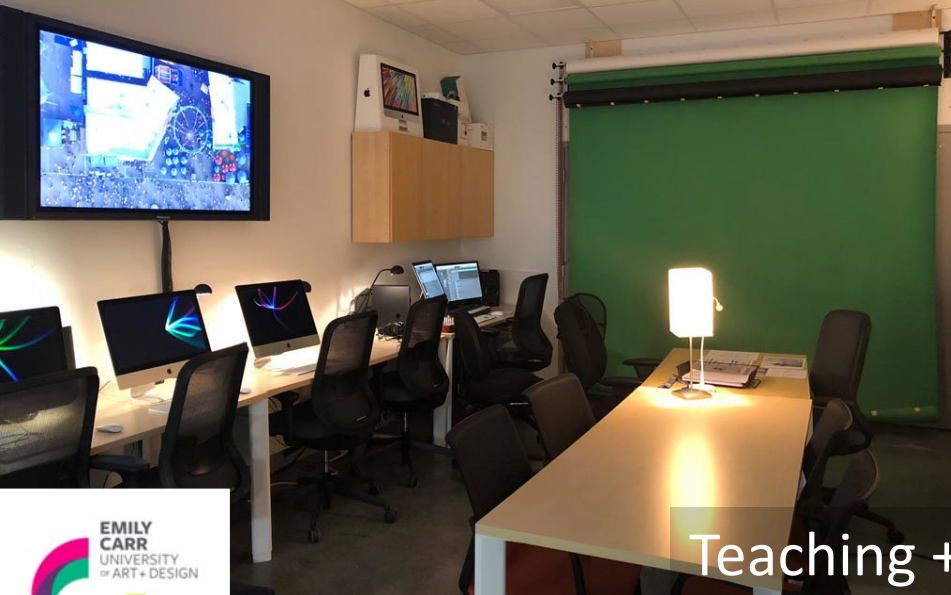
Innovation & Instructional Technologies Centre